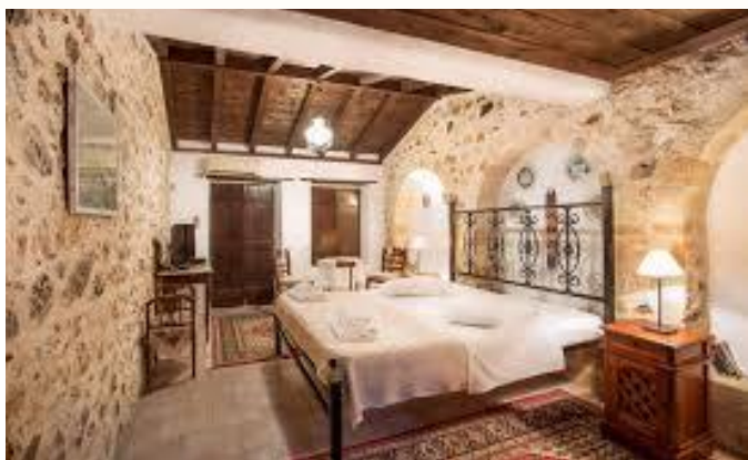
Our Hotel Room in Laconia

Carefully selected Hotel Accommodations (8 nights)